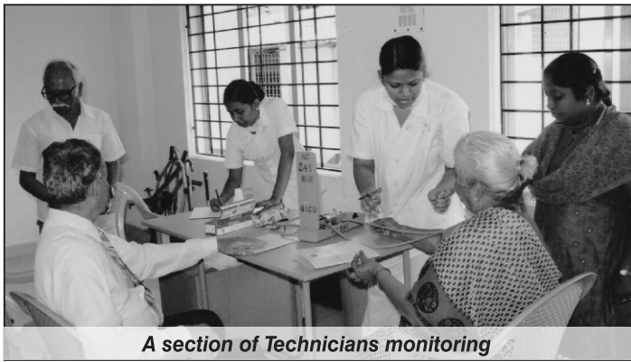
A section of Technicians monitoring